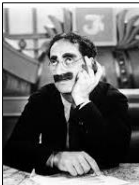
“Duck Soup” (1933)

Minister of Finance: Here is the Treasury Department's report, sir. I hope you'll find it clear.