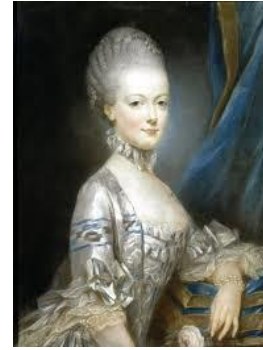
Marie Antoinette (1755 – 1793)