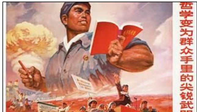
Mao Zedong Thought poster (ca. 1970)

The rarity isn't the Narrative that dies and fades into myth, but the Narrative that survives by re-inventing itself, by finding its words and stories repurposed and retold for a modern ear. For example, the Narrative of the American Founding Fathers is as potent today as it was 100 years ago, maybe more so, and that was before Hamilton gave it a new telling and a new power chord.