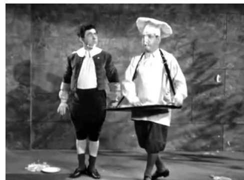
“Fiddlers Three” (1948)

Stooges: Simple Simon met a pieman, Going to the fair; Says Simple Simon to the pieman, Let me taste your ware. Said the pieman to Simple Simon, Show me first your penny. Said Simple Simon to the pieman: Moe: Scram! Ya don't get any! [throws pie in face]