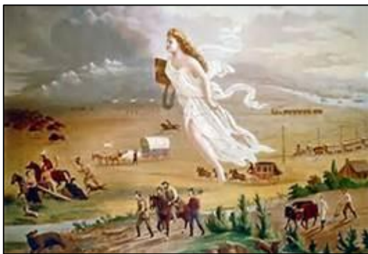
John Gast, "American Progress" (ca. 1872)

We've seen this before. History is littered with failed Narratives, once-powerful arrays of Common Knowledge that somehow lose their ability to compel human behavior and eventually become mere myth. That's where Narratives go to die. They become fables, stories that we chuckle at, stories that we shake our heads at and ask "did people really believe in all that?" Michel de Montaigne — who invented the essay as a literary form and was the first blogger, albeit more than 400 years before Al Gore invented the Internet — wrote about the devolution of faith to fable back in the 16 th century. It's a phenomenon as old as humanity itself. Manifest Destiny ... Cultural Revolution ... these were Narratives every bit as powerful in their day as European Union or Clinton in ours. Now they're historical curiosities, something you come across on a Wikipedia bender.